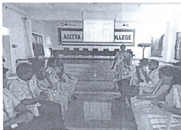
Debate round for Batch 2 students